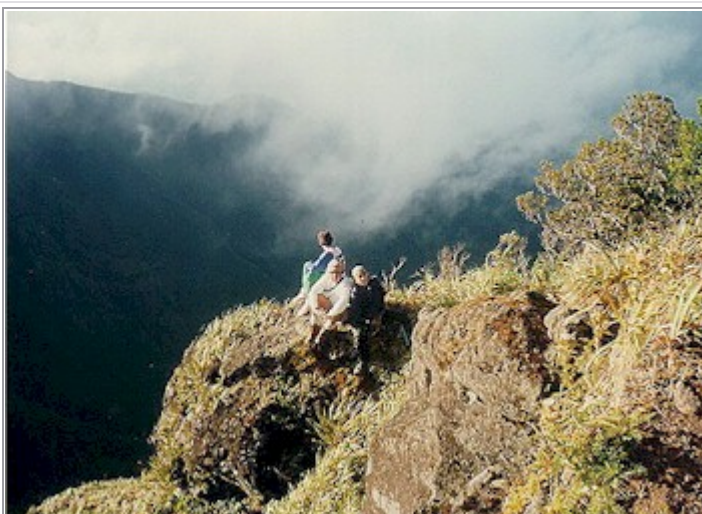
Viewpoint from Banahaw's Crater