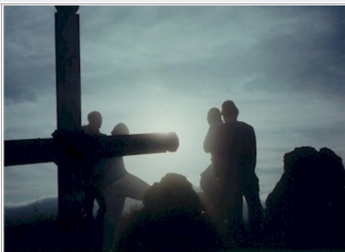
The famous Calvary Cross