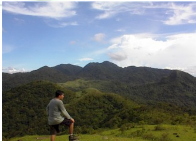
The Malipuno Peaks seen from Manabo Camp Site

Manabo Peak is one of the numerous peaks of Mt. Malipuno. Actually, Mt. Malipuno itself is one confusing mountain. Some calls the whole mountain range as Mt. Malarayat but locals calls them Malipuno. Mountaineers calls Malipuno the main peak or the highest point, the summit. They have christened two of the other peaks as Manabo and Bagwis (Susong Dalaga). There are lots of local trails along the mountain so chances are there are more than three peaks that you can discover in Malipuno but right now, only three peaks are climbed, Malipuno, Manabo and Bagwis. There are however, recorded traverses from Laguna to the Quezon side of the mountain passing by the three peaks. Malipuno and Bagwis is accessible from Barangay Talisay in Lipa Batangas while Manabo is in Barangay Sta Cruz, Sto. Tomas Batangas.