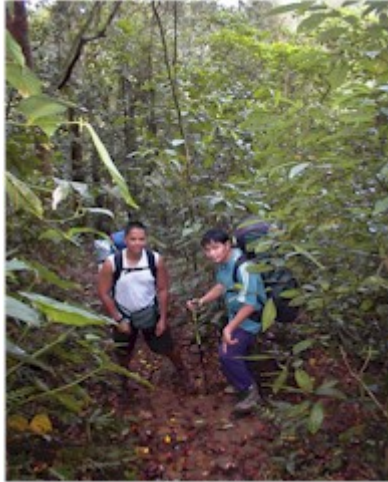
Forest Line Trail