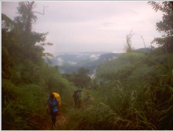
Wide Trail to Basecamp