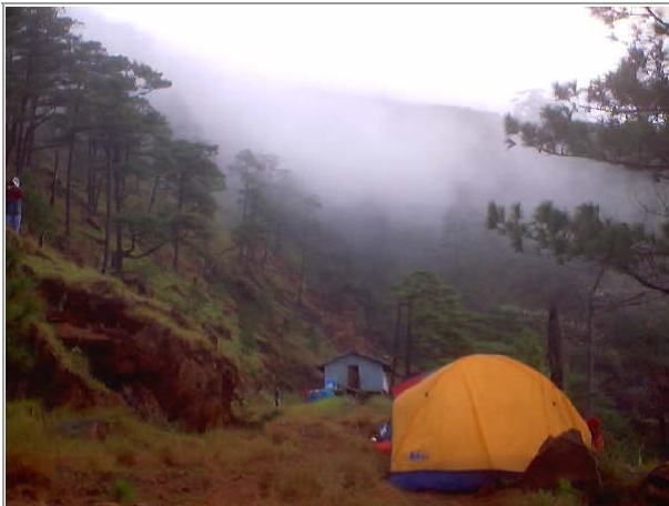
Campsite with Bunker at the Back