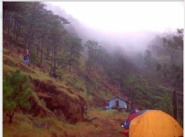
The trail to the Summit