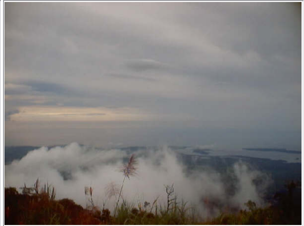
Already above the clouds