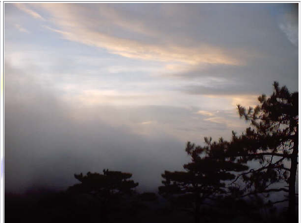
Wonderful Weather !