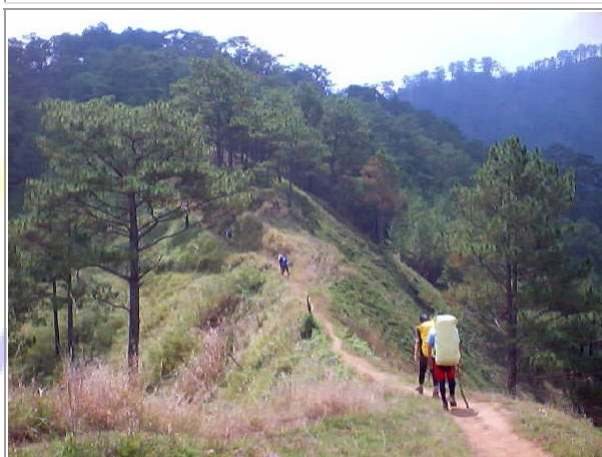
Crossing Mountains (Saddle)