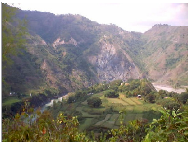
Awesome viewpoint to Lusod