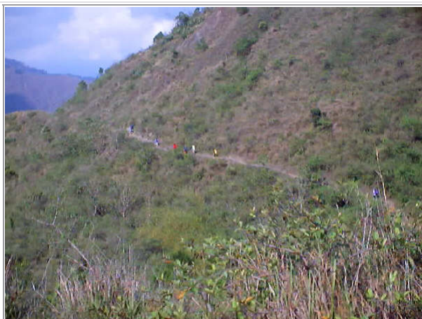
Like ants on an Ant Hill