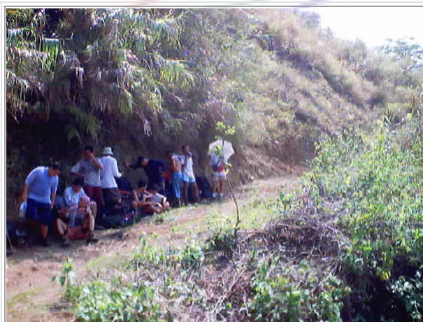
Hot open trail to Lusod