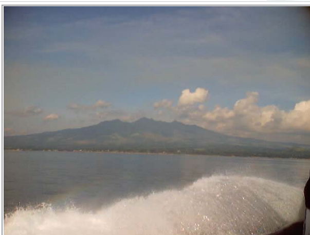
Mt. Mariveles as seen from the Ferry Boat