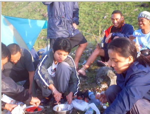
Si Oyie cook ?