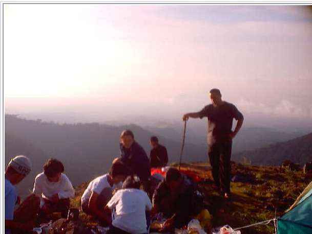
Awesome View from the Campsite