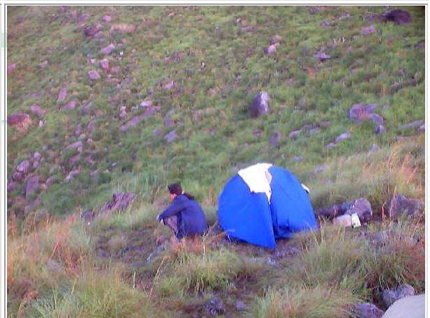
Inclined Campsite ?