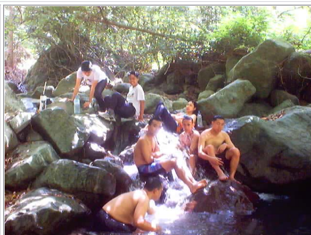
Papaya River Along the Trail