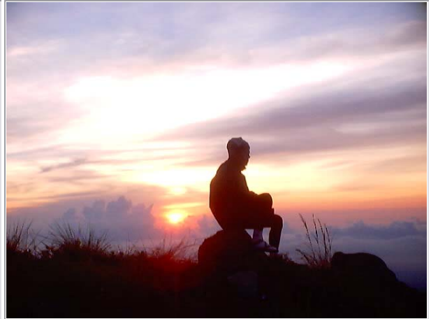
Time for Reflection