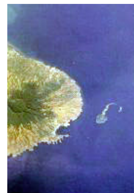
Space Shuttle photo STS045-152-274 taken in March 1992

Located at 14.5N, 120.5 E, this 1,288 high mountain is a stratovolcano with no historic activity. A single carbon-14 date from a volcanic sample yielded a date of 2050 BC. Bordering Mariveles is the Manila Bay and the famous Corregidor Island. From Tarak Ridge, you will have a 270 degrees viewpoint of interesting places such as Corregidor Island, Mt. Samat, Mariveles Ridgeline and the town of Mariveles and its port.