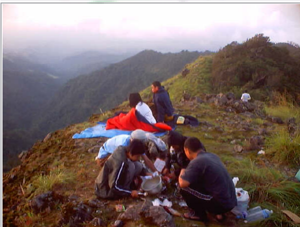
What is it like to be in the Ridge